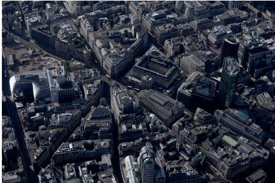
Michael Molloy The City photograph

Large cities seen from above can appear fragmented. Michael Molloy captures this idea in a complex image.