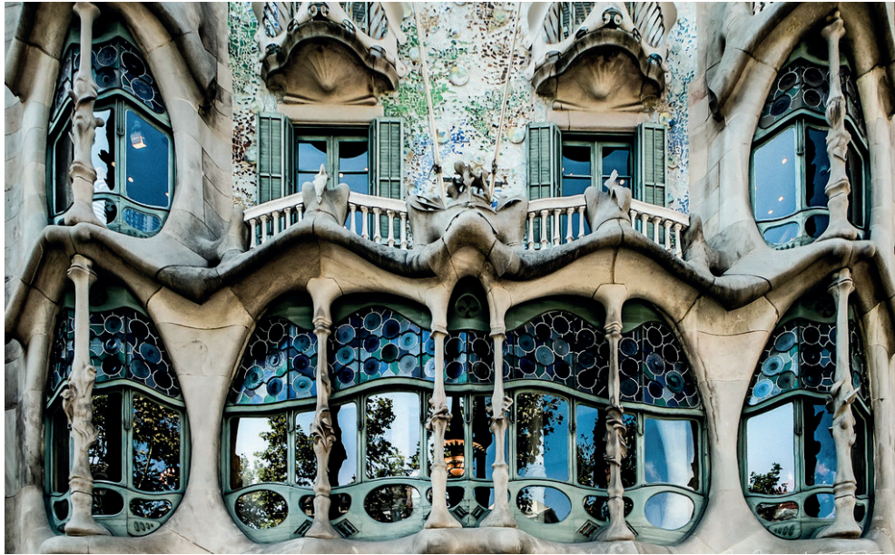
Antoni Gaudí Casa Batlló architecture

Antoni Gaudí uses fragments of ceramic tiles to decorate a building.