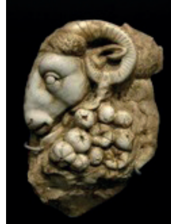
Mediterranean: circa 30 BC Fragment depicting the Head of a Ram sculpture

Some artists use distinctive techniques to make art. Clifford Possum Tjapaltjarri's decorative painting shows two lizards almost camouflaged because the painting is made up of many small dots.