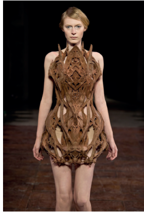
Iris van Herpen Cathedral Dress fashion design

Broken, smashed or torn fragments can be used to make art. Cornelia Parker uses an explosion to reduce a garden shed into many fragments to make a stunning installation