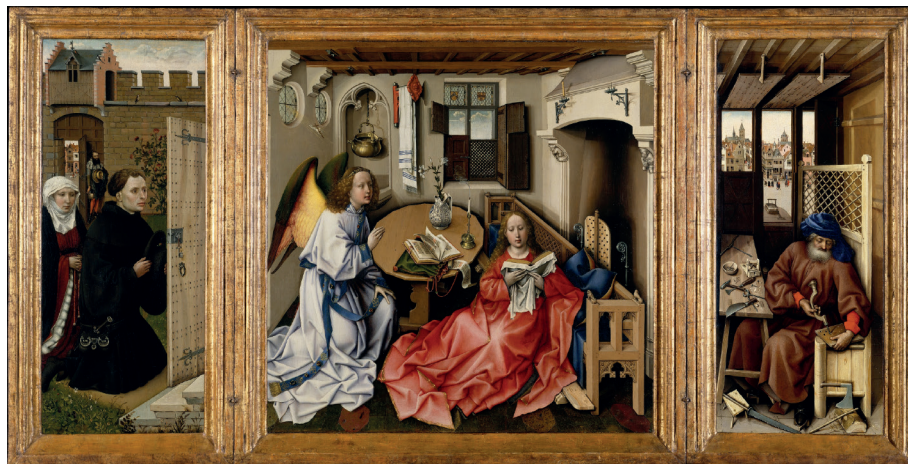
Robert Campin Annunciation Triptych painting

Artwork made to be displayed in a particular space may be made up of different parts to tell a story. Robert Campin painted a triptych for a church altar.