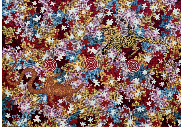
Clifford Possum Tjapaltjarri Lizard (Perentie Dreaming) painting

Some artists use distinctive techniques to make art. Clifford Possum Tjapaltjarri's decorative painting shows two lizards almost camouflaged because the painting is made up of many small dots.