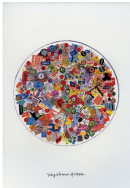
Alan Fletcher Vagabond Pizza (series) graphic design

Todd McLellan's photograph depicts all the components of an old camera meticulously laid out on a white background to make a fascinating image.