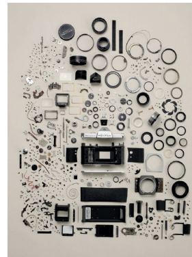
Todd McLellan Old Camera photograph

El Anatsui recycles aluminum cans and bottle tops, and then sews all the fragments together with copper wire to transform them into a metallic hanging.