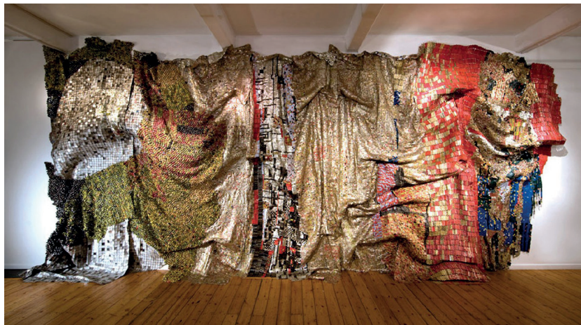
El Anatsui In the World but Don't Know the World textile

El Anatsui recycles aluminum cans and bottle tops, and then sews all the fragments together with copper wire to transform them into a metallic hanging.