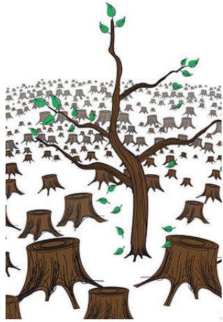
William Hogan Deforestation poster

Fragments of carvings are found depicting animals or plants from the past. Fragments of sculpture like the ram's head ( Mediterranean: circa 30BC ) are often used by artists, designers and craft workers to inspire contemporary art.