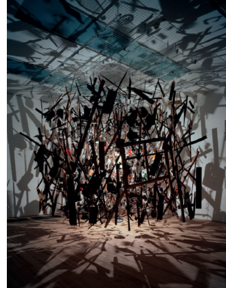
Cornelia Parker Cold Dark Matter: An Exploded View installation

Artwork made to be displayed in a particular space may be made up of different parts to tell a story. Robert Campin painted a triptych for a church altar.