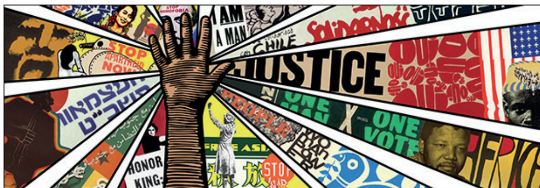
Paula Scher 'Human Rights' mural

Artists, designers and craft workers sometimes use fragments of work from other artists and incorporate them into their own work. Paula Scher creates a powerful mural using fragments from human rights posters.