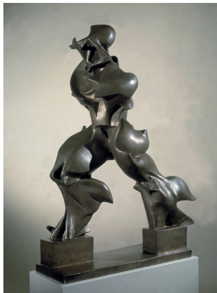
Umberto Boccioni Unique Forms of Continuity in Space sculpture

Artists explore new ways to express human form. Umberto Boccioni created a bronze sculpture of a figure made up of fragmented shapes and forms to express movement.