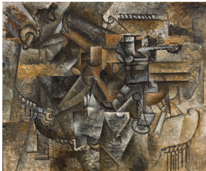
Pablo Picasso Glass of Absinthe painting

Artists often search for new ways of working. Pablo Picasso painted an abstract image using fragmented shape and form.