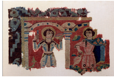
Byzantine Fragment of tapestry textile

A fragment of fragile Byzantine tapestry shows details of everyday life.