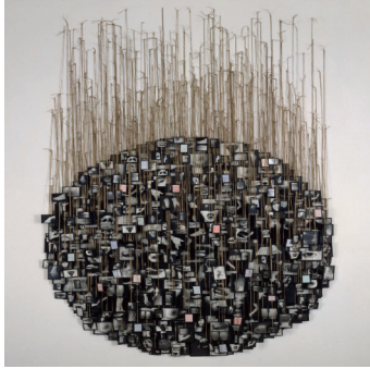
Annette Messager My Vows photographic installation

Artists, designers and craft workers can be inspired by the human form. Annette Messager uses separate photographs to present an image of a person.